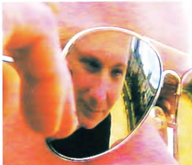
Baktruppen: from the video DIRECTIONS FOR USE, Palermo, 1993.