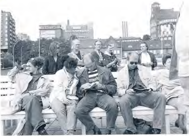
Baktruppen: Publicity picture for the production TONIGHT, Hamburg, 1994.

BAKTRUPPEN is a prime example of the new development in theatre at the point of intersection between performance art and theatre. Initially they worked a lot on actions of both a conceptual and a commentary nature, in cafés and open spaces, such as the Cafe Opera and The City Square in Bergen, but it is as a project theatre that they have gained international recognition. Yet, their working method has taken in the action form as well as obvious elements of live art or performance art, not least in the use of 'real time', or of presence in a communication process without creating the illusion of plot. This move towards using approaches from both performance art and direct, loosely narrative drama, often paraphrasing textual material, could be termed recycling.