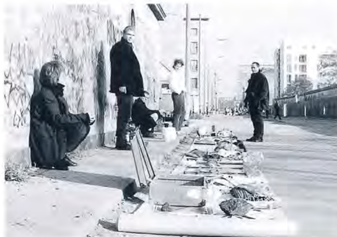
Baktruppen: Action in Niederkirchner Strasse, Berlin, 1991.