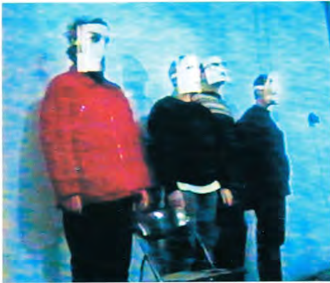
Baktruppen: from the performance " ", Berlin 1992. (" " is a performance in 11 sequences).